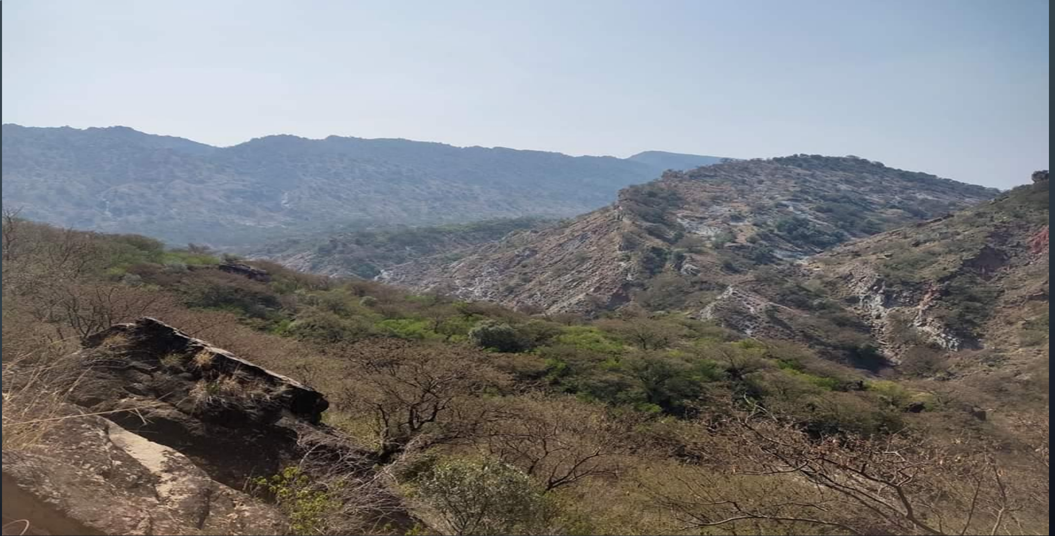
The Samarkand Mountain