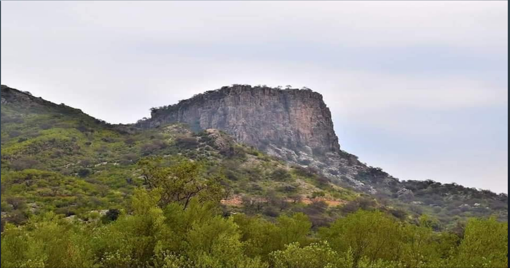
The mountain on which Tulaja fort is located