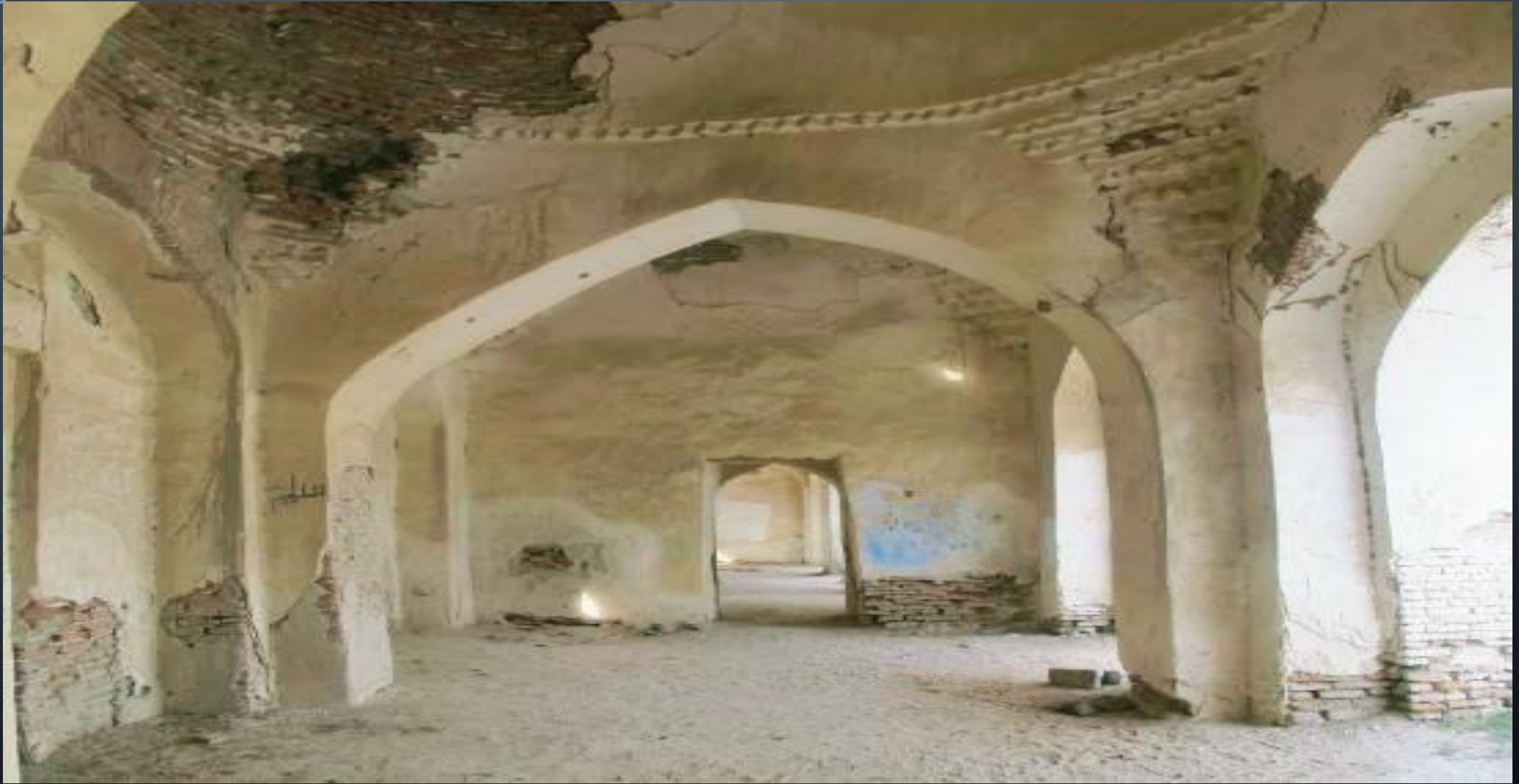
View of mosque from Inside