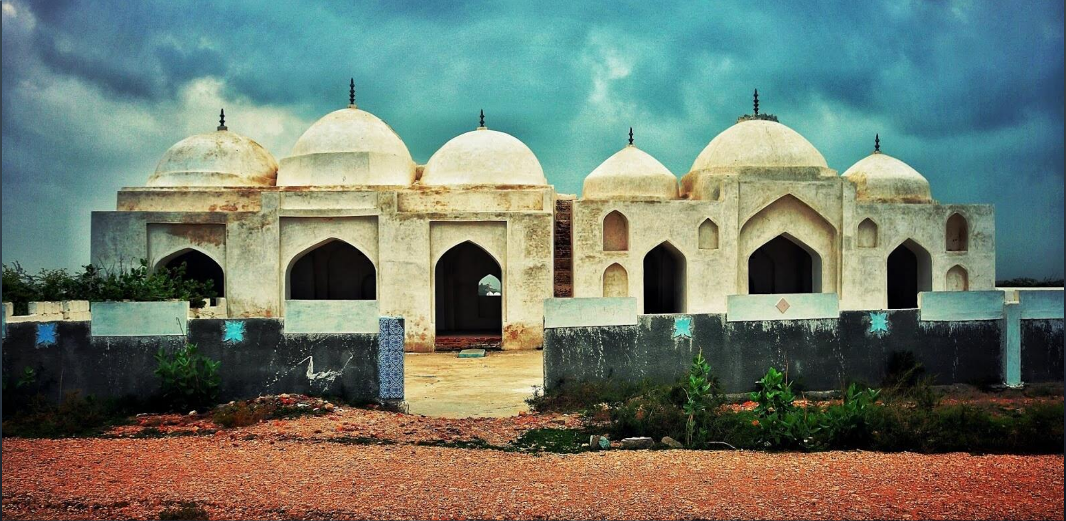
The mosque which was built by Sultan Jalaluddin Khwarzam Shah in Sindh.