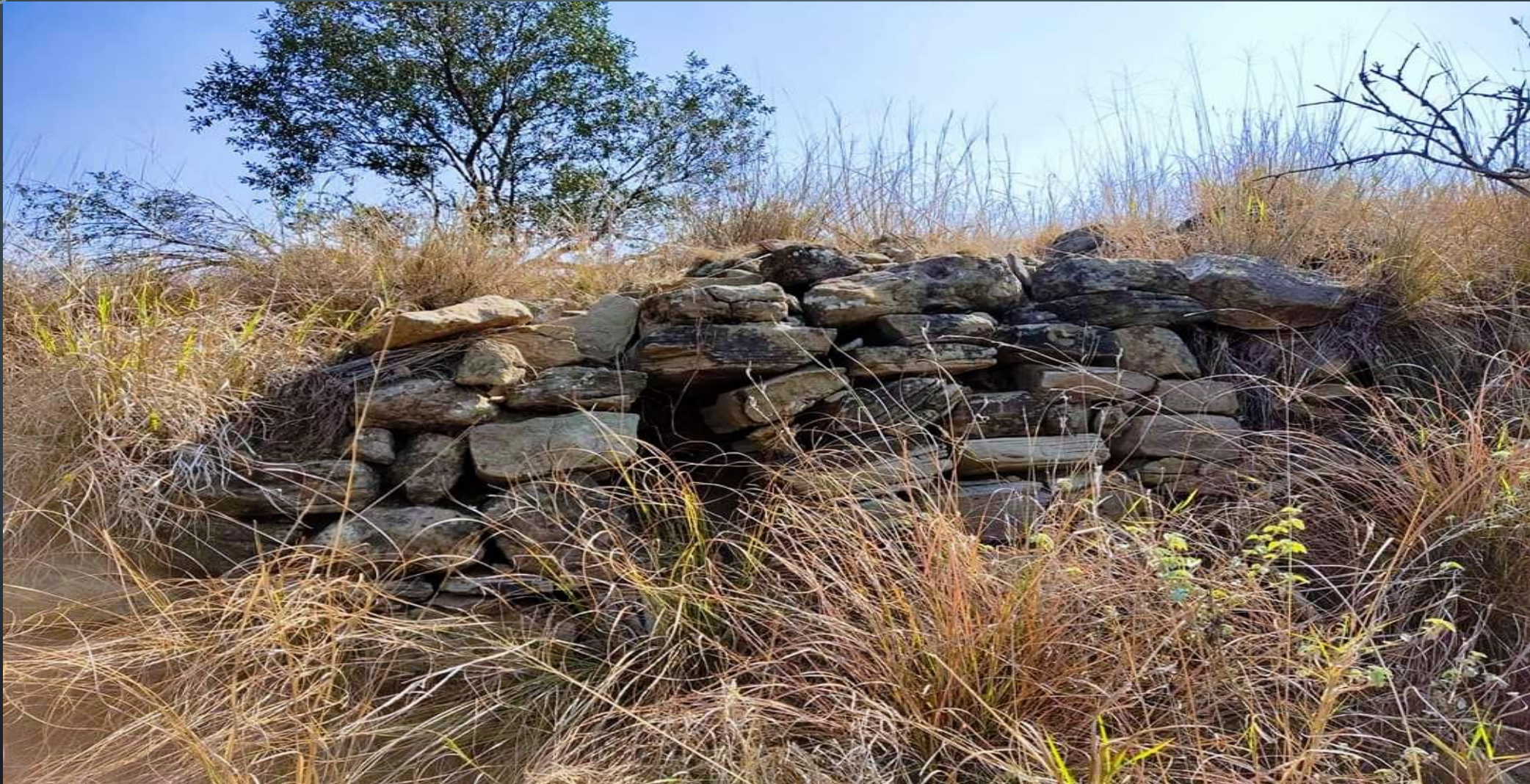
A destructed wall of Samarkand Mountain