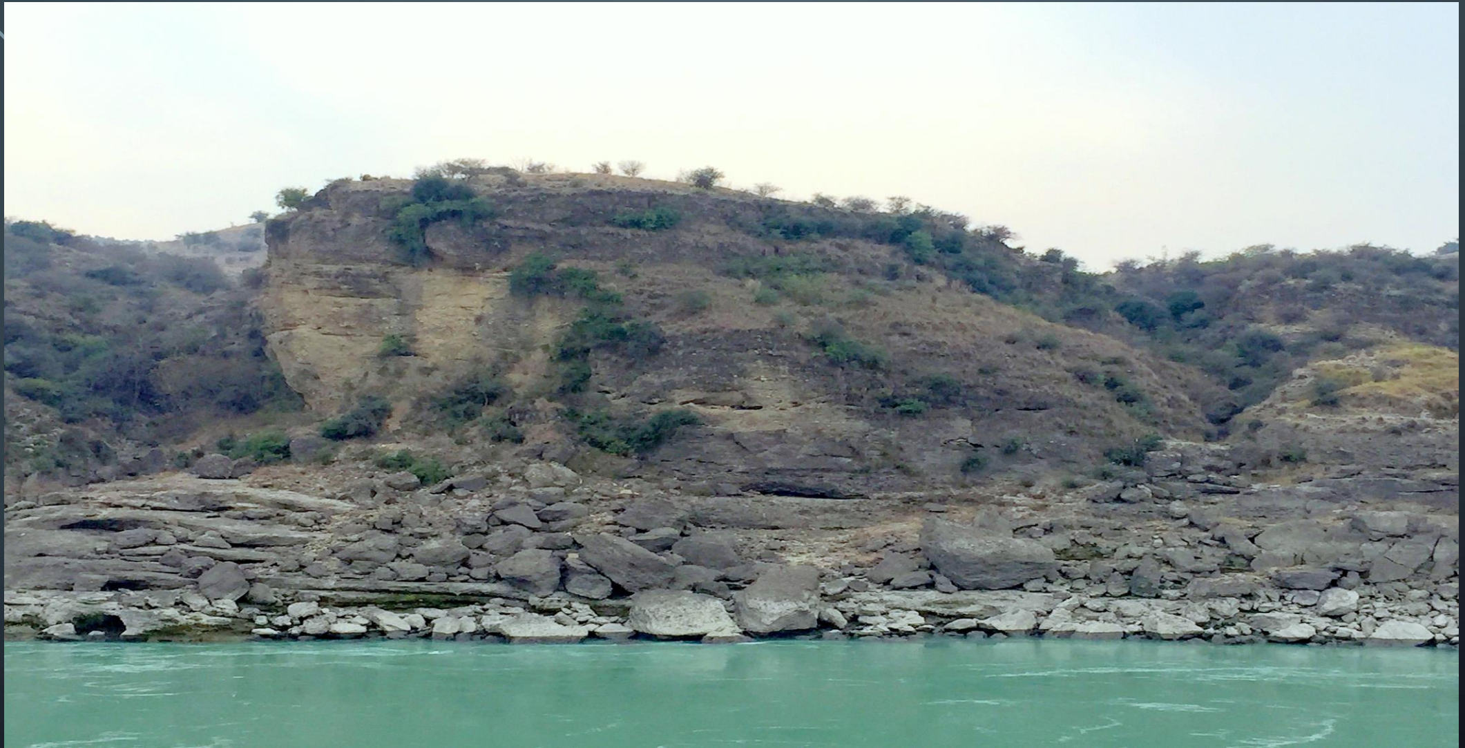
The rock from which Sultan Jalaluddin Khwarzam Shah jumped into Indus River.