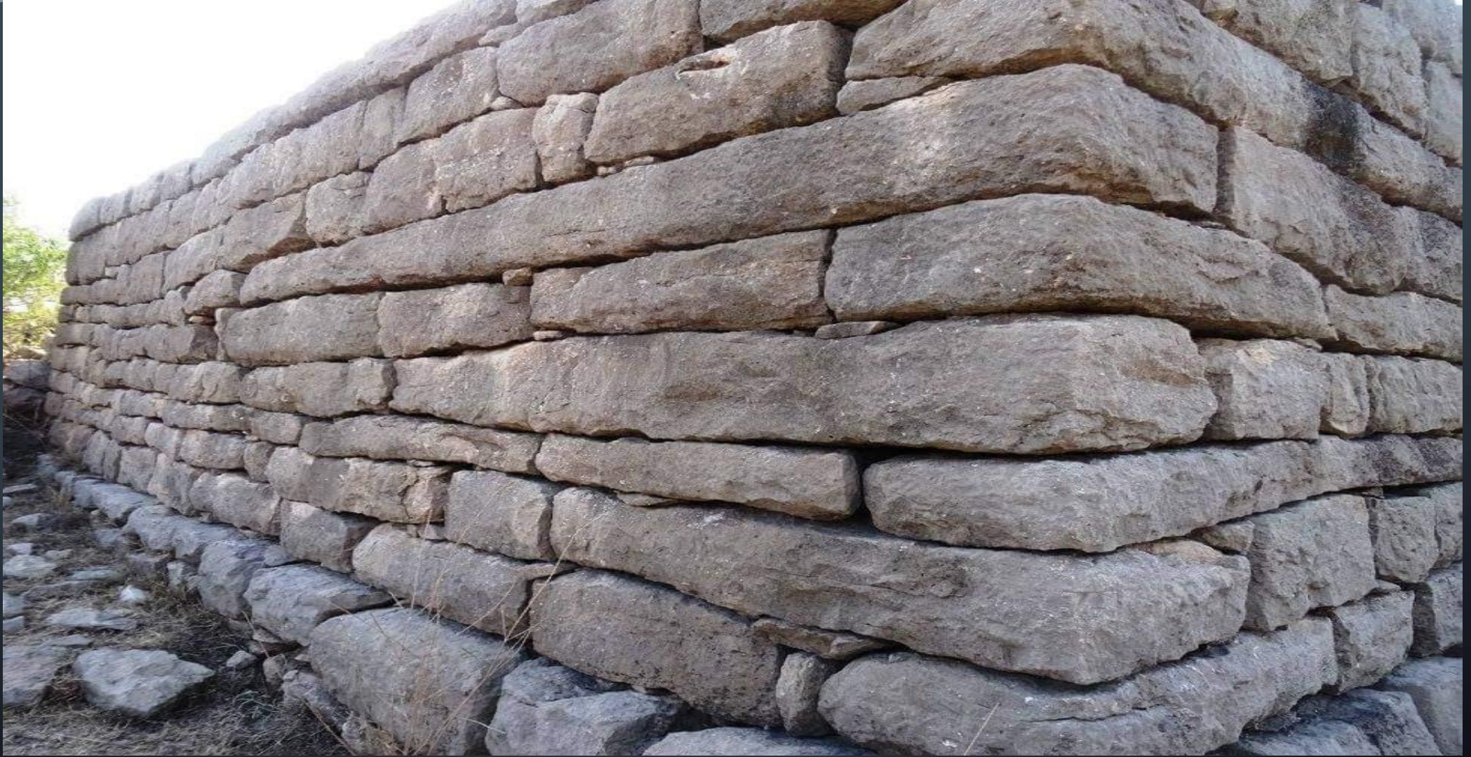
A wall of Tulaja fort constructed by stones